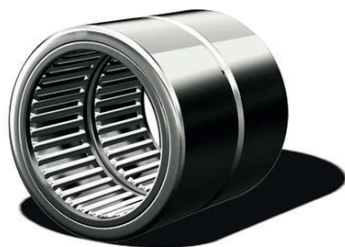
NK - NKS